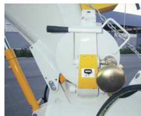
New safety system