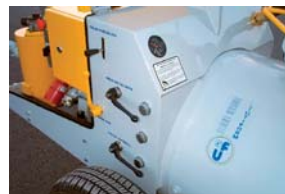
Easy to operate.