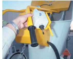
Remote control for Scrap

Always use original spare parts and tools. Due to continuous improvement and development all machines can be modified without previous advice.