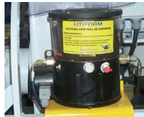
Automatic greasing system