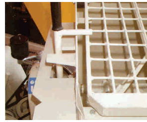
3. Grill safety system