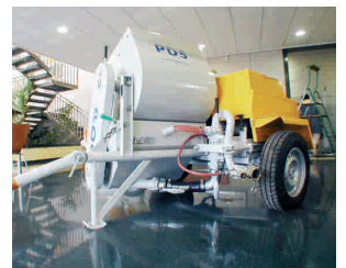
8. Complete machine