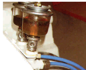
7. Oil tanks easy to fill