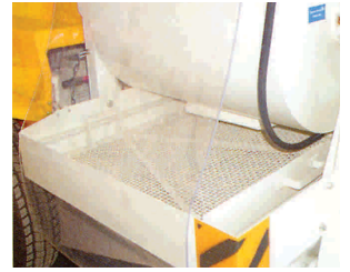
2. Protection system