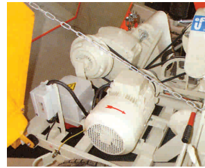
5. Electric Version