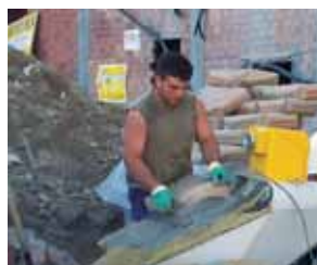
Low filling height.