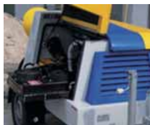
Patented radiator system.