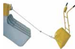
Scraper with remote control.