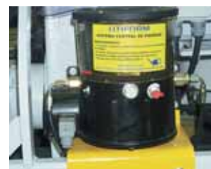
Automatic greasing system.