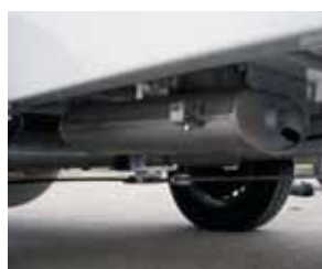
Exhaust pipe on opposite side to operator.