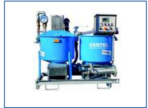
IS-35-E with various accessories