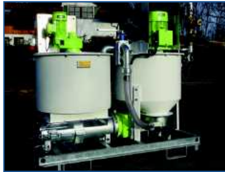
IS-35-E / IS-35-E-light